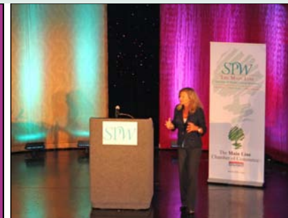
LISA TALKED ABOUT HER FAVORITE FEMALE IN FICTION, NANCY DREW. "WOMEN NEED TO BE MORE LIKE NANCY," LISA SAID. "HER SUPERPOWER IS HER WIT AND SMARTS. CHANNEL YOUR INNER NANCY: BE YOUR OWN WOMAN AND DRIVE A ROADSTER."